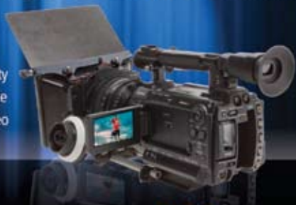
PHOTO | VIDEO | DIGITAL | SALES | RENTALS | SERVICE PRODUCTION VIDEO SOLUTIONS GROUP 496 Queen St. East, Toronto | 416-365-1777 ext. 3322 | pvs@vistek.ca

For over 30 years, Vistek has been a valued resource & retailer to the video community and is pleased to announce the newly-formed Production Video Solutions Group.